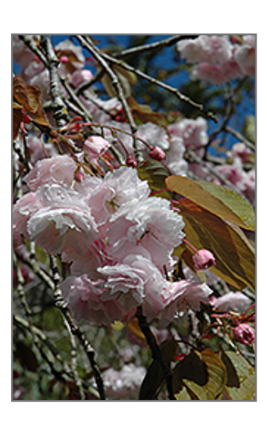
White Flowering Cherry flowers

White Flowering Cherry is covered in stunning clusters of fragrant double shell pink flowers along the branches in early spring, which emerge from distinctive ruby-red flower buds before the leaves. It has attractive deep purple-tipped dark green foliage which emerges burgundy in spring. The serrated pointy leaves are highly ornamental and turn an outstanding orange in the fall. The smooth dark red bark adds an interesting dimension to the landscape.