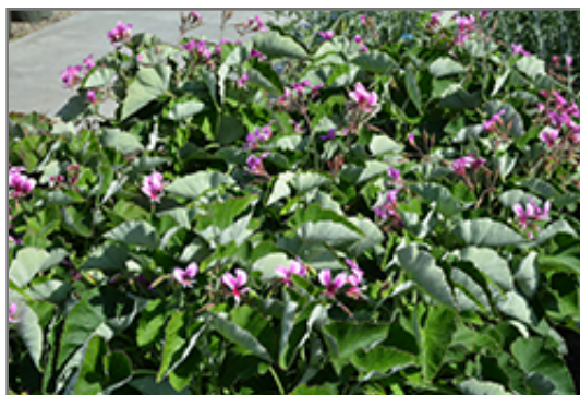
Heartleaf Geranium in bloom