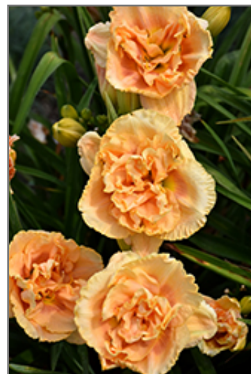
Rainbow Rhythm Siloam Peony Display Daylily flowers

Rainbow Rhythm Siloam Peony Display Daylily is recommended for the following landscape applications;