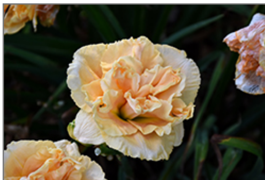
Rainbow Rhythm Siloam Peony Display Daylily flowers