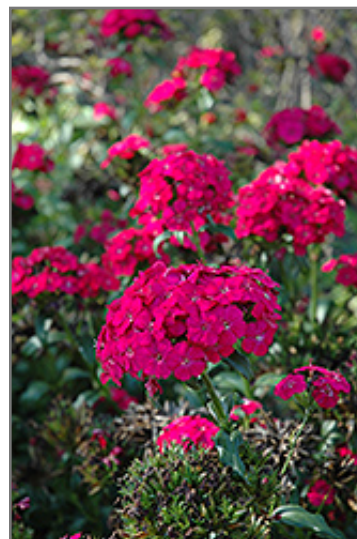
Amazon Neon Cherry Pinks flowers

This is a relatively low maintenance plant, and is best cleaned up in early spring before it resumes active growth for the season. It is a good choice for attracting bees and butterflies to your yard, but is not particularly attractive to deer who tend to leave it alone in favor of tastier treats. It has no significant negative characteristics.