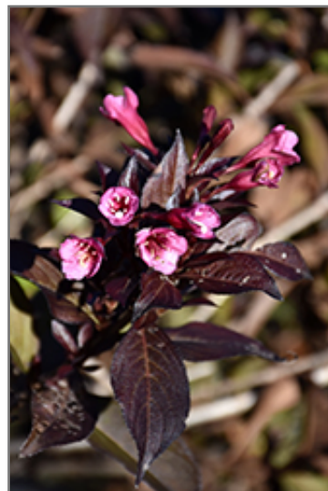
Fine Wine Weigela flowers