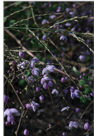
Splendide Meadow Rue flowers