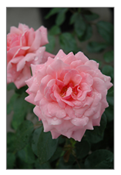
Sexy Rexy Rose flowers