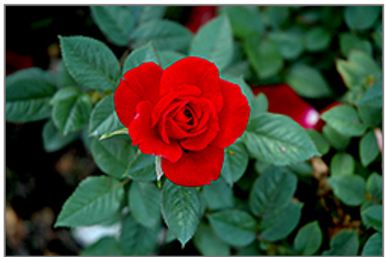
Ruby Ruby Rose flowers