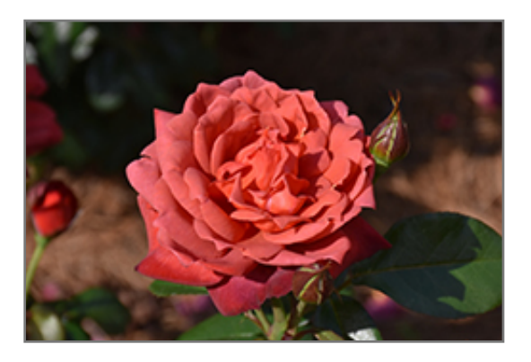
Hot Cocoa Rose flowers