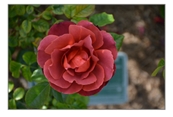
Hot Cocoa Rose flowers