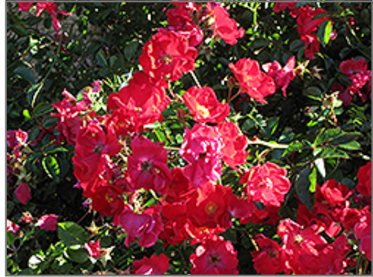
Flower Carpet Red Rose flowers

This shrub should only be grown in full sunlight. It does best in average to evenly moist conditions, but will not tolerate standing water. It is not particular as to soil type or pH. It is somewhat tolerant of urban pollution. This particular variety is an interspecific hybrid.