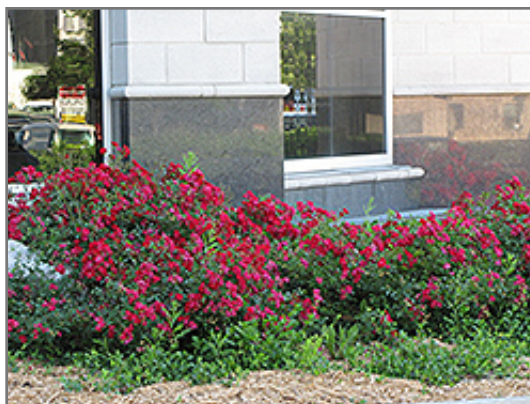
Flower Carpet Red Rose in bloom