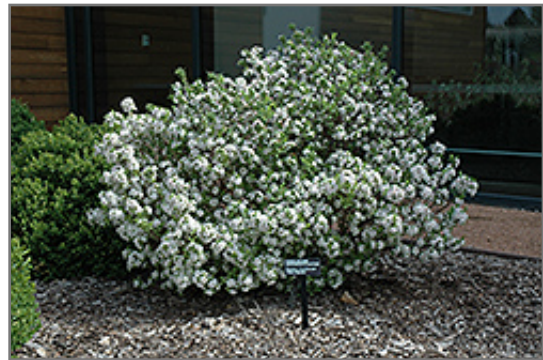
Carol Mackie Daphne in bloom