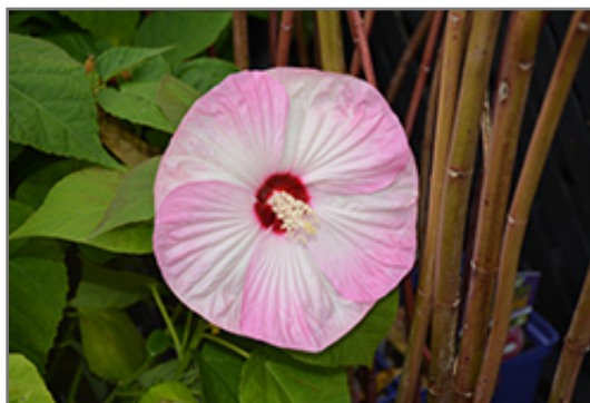
Luna Pink Swirl Hibiscus flowers