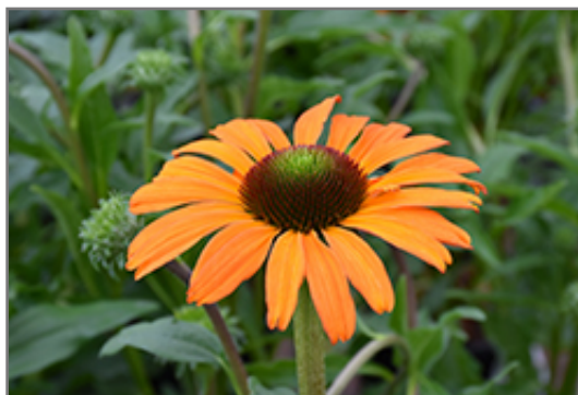
Tangerine Dream Coneflower flowers

Tangerine Dream Coneflower is recommended for the following landscape applications;