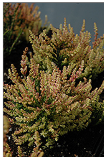
Spring Torch Heather foliage