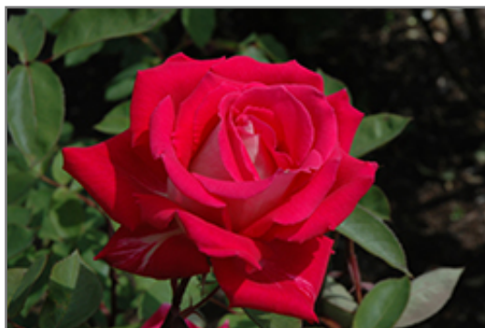
Love Rose flowers

Love Rose is recommended for the following landscape applications;