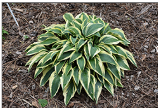
Wolverine Hosta

Wolverine Hosta will grow to be about 12 inches tall at maturity extending to 18 inches tall with the flowers, with a spread of 3 feet. When grown in masses or used as a bedding plant, individual plants should be spaced approximately 30 inches apart. Its foliage tends to remain dense right to the ground, not requiring facer plants in front. It grows at a medium rate, and under ideal conditions can be expected to live for approximately 10 years. As an herbaceous perennial, this plant will usually die back to the crown each winter, and will regrow from the base each spring. Be careful not to disturb the crown in late winter when it may not be readily seen!