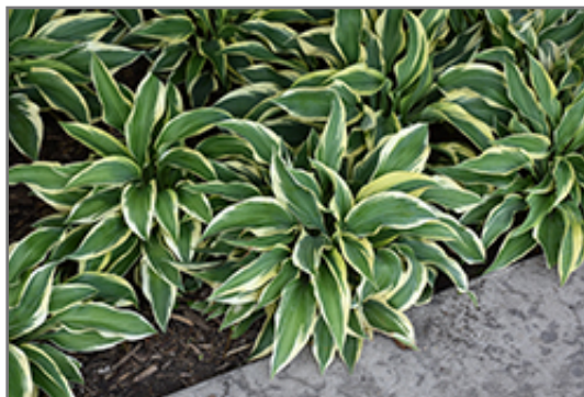
Wolverine Hosta