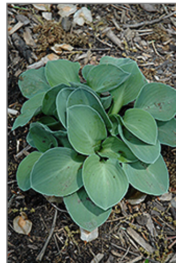
Blue Mouse Ears Hosta