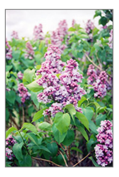
Emile Lemoine Lilac flowers

This old French lilac features fragrant double bluish-lavender flowers from pink buds on an upright, multi-stemmed shrub, very hardy, tends to sucker, ideal for screening; full sun and well-drained soil, allow room for air movement