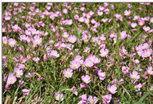
Evening Primrose flowers

This plant should only be grown in full sunlight. It prefers dry to average moisture levels with very well-drained soil, and will often die in standing water. It is considered to be drought-tolerant, and thus makes an ideal choice for a low-water garden or xeriscape application. It is not particular as to soil type or pH. It is somewhat tolerant of urban pollution. This species is native to parts of North America. It can be propagated by division.