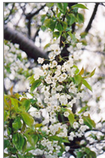
Sweet Cherry flowers

Sweet Cherry is covered in stunning clusters of fragrant white flowers hanging below the branches in early spring before the leaves. It has dark green deciduous foliage. The pointy leaves turn yellow in fall. The fruits are showy red drupes carried in abundance in mid summer. The fruit can be messy if allowed to drop on the lawn or walkways, and may require occasional clean-up. The smooth dark red bark adds an interesting dimension to the landscape.