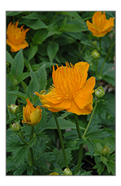
Golden Queen Globeflower flowers

Golden Queen Globeflower has masses of beautiful semi-double gold buttercup flowers with orange anthers at the ends of the stems from late spring to early summer, which are most effective when planted in groupings. The flowers are excellent for cutting. Its deeply cut lobed leaves remain dark green in colour throughout the season.