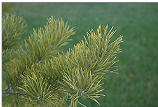
Scotch Pine foliage