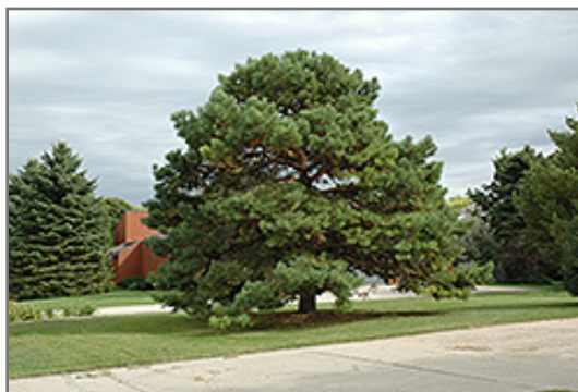
Scotch Pine

Scotch Pine is recommended for the following landscape applications;