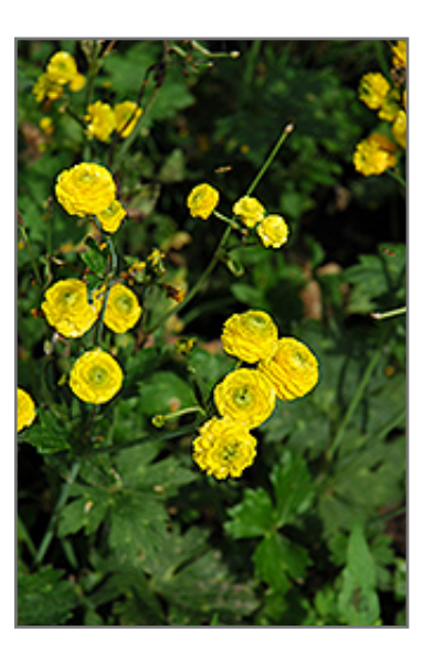
Yellow Bachelor's Button flowers

Yellow Bachelor's Button has masses of beautiful double yellow round flowers at the ends of the stems from early summer to late fall, which are most effective when planted in groupings. The flowers are excellent for cutting. Its serrated lobed leaves remain green in colour throughout the season.