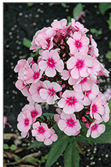
Bright Eyes Garden Phlox flowers

Bright Eyes Garden Phlox is a fine choice for the garden, but it is also a good selection for planting in outdoor pots and containers. With its upright habit of growth, it is best suited for use as a 'thriller' in the 'spiller-thriller-filler' container combination; plant it near the center of the pot, surrounded by smaller plants and those that spill over the edges. It is even sizeable enough that it can be grown alone in a suitable container. Note that when growing plants in outdoor containers and baskets, they may require more frequent waterings than they would in the yard or garden.