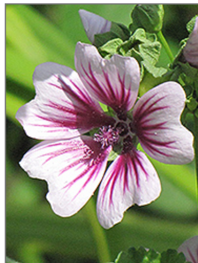
Zebrina Mallow flowers