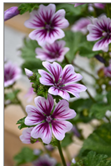
Zebrina Mallow flowers