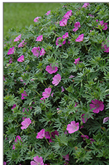
Bloody Cranesbill flowers