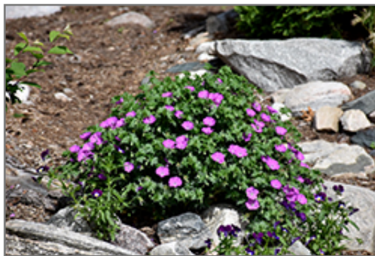
Bloody Cranesbill in bloom