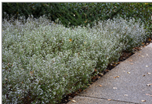
Dwarf Calamint in bloom

Dwarf Calamint is recommended for the following landscape applications;