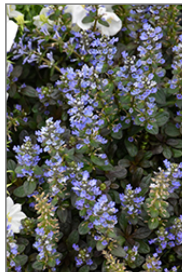
Chocolate Chip Bugleweed flowers

Chocolate Chip Bugleweed is recommended for the following landscape applications;