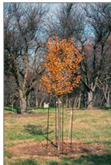
Lancelot Flowering Crab fruit