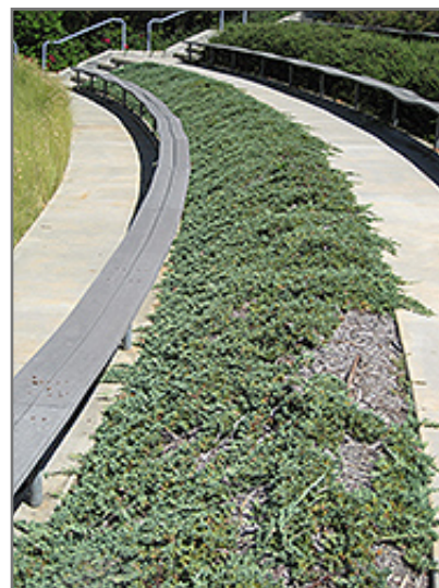
Blue Carpet Juniper