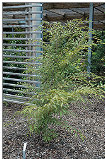
Silver Lace Japanese Hornbeam