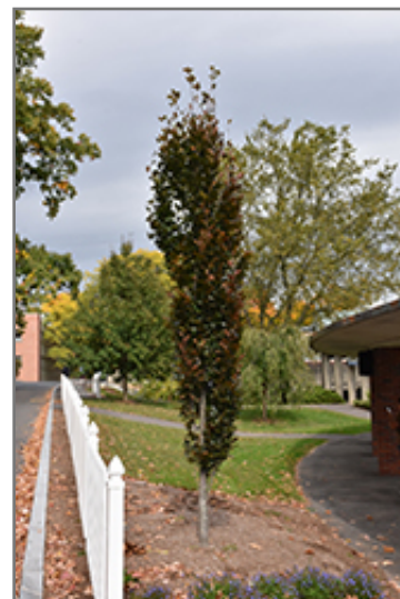
Dawyck Purple Beech