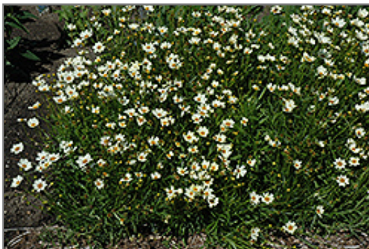
Star Cluster Tickseed in bloom