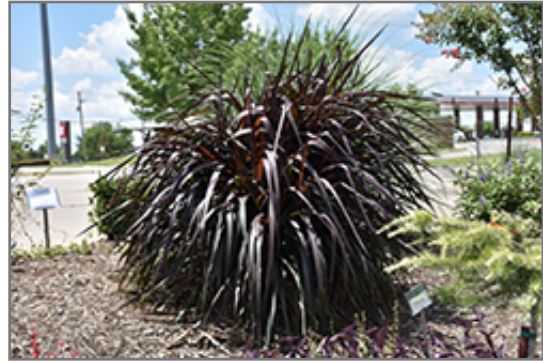
Princess Caroline Fountain Grass

Princess Caroline Fountain Grass is recommended for the following landscape applications;