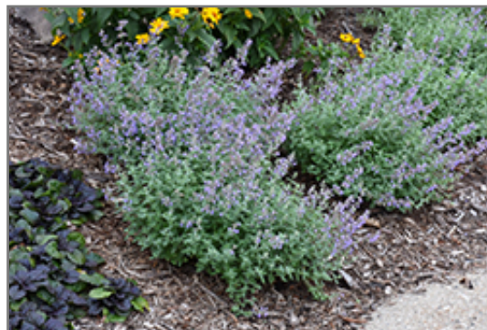
Purrsian Blue Catmint in bloom