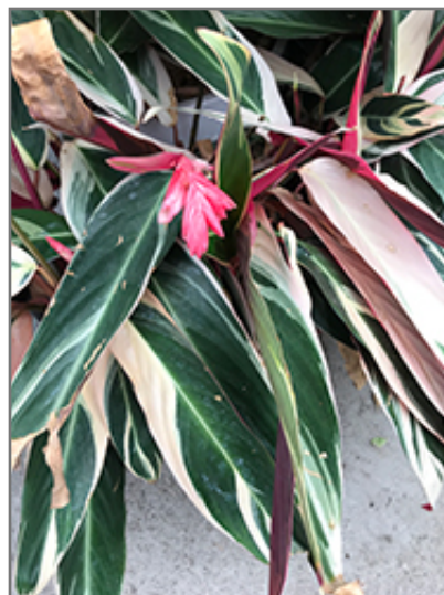
Tricolor Stromanthe flowers

This plant does best in full sun to partial shade. It prefers to grow in average to moist conditions, and shouldn't be allowed to dry out. It is not particular as to soil pH, but grows best in rich soils. It is somewhat tolerant of urban pollution. This is a selected variety of a species not originally from North America. It can be propagated by division; however, as a cultivated variety, be aware that it may be subject to certain restrictions or prohibitions on propagation.