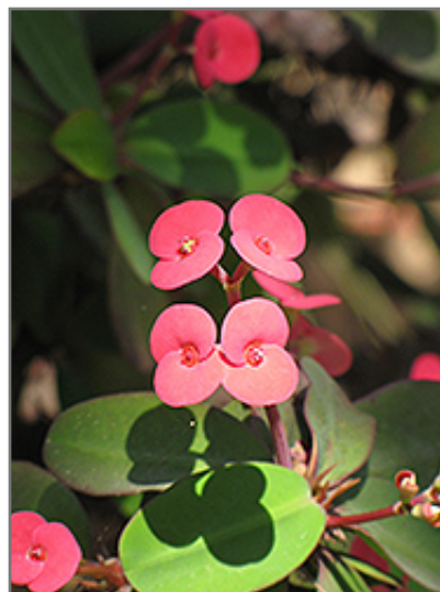
Crown Of Thorns flowers

Crown Of Thorns is recommended for the following landscape applications;