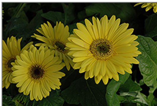
Royal Yellow Gerbera Daisy flowers