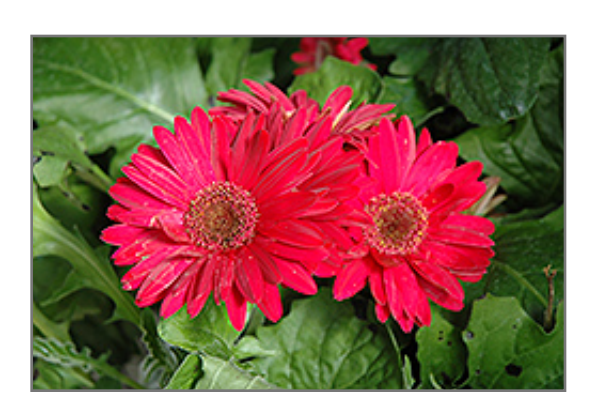
Royal Deep Rose Gerbera Daisy flowers