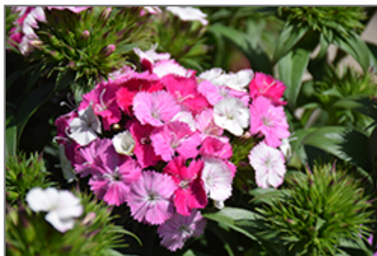
Amazon Rose Magic Pinks flowers

Amazon Rose Magic Pinks is recommended for the following landscape applications;