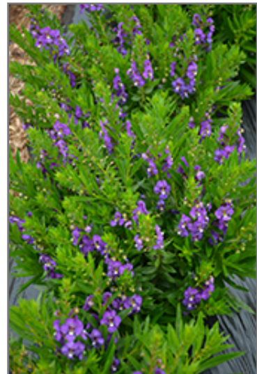
Adessa Blue Angelonia in bloom