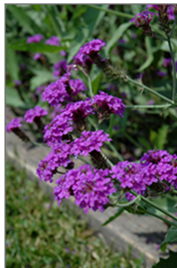
Santos Purple Verbena flowers

Santos Purple Verbena is recommended for the following landscape applications;