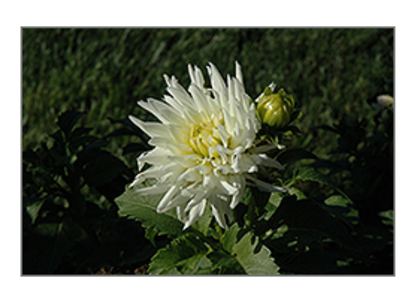
XXL Mayo Dahlia flowers