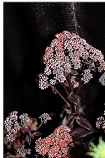
Orbit Bronze Stonecrop flowers