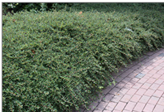
Coral Beauty Cotoneaster