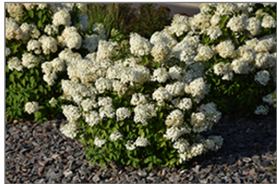
Bobo Hydrangea in bloom