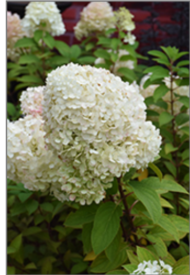
Bobo Hydrangea flowers