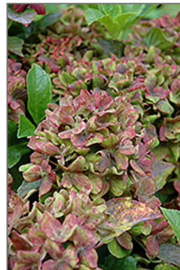
Pistachio Hydrangea flowers