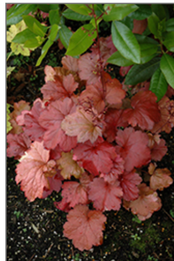
Galaxy Coral Bells