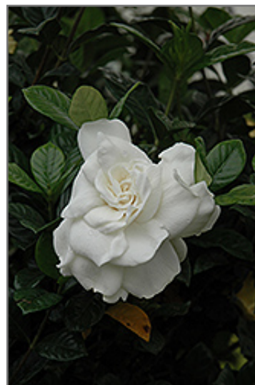
Gardenia (tree form) flowers