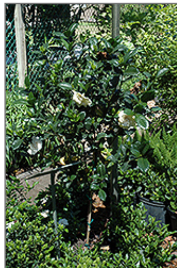
Gardenia (tree form) in bloom