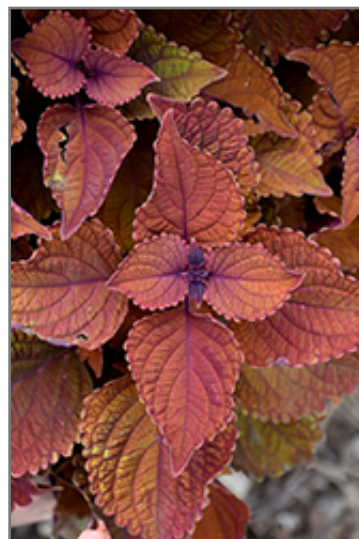
Wall Street Coleus foliage